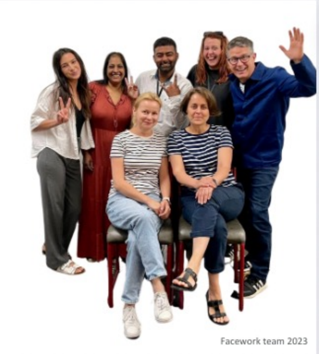
Facework team 2023